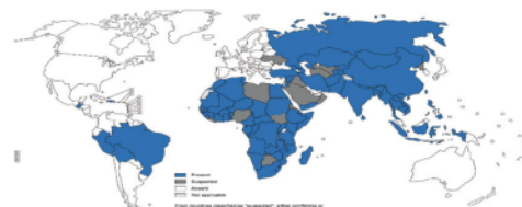
Figure 1 Presence of dog-transmitted human rabies based on most recent data points from different sources, 2010–2014 2

Rabies virus is found in large quantities in the saliva of infected animals, and transmission occurs almost exclusively through inoculation of the infected saliva through a bite or scratch from a rabid mammal. 2,4 Approximately 35%-50% of people bitten by a known rabies infected animal do not receive post-exposure prophylaxis (PEP). The transmission rate is increased if the victim has suffered multiple bites and if the inoculation occurs in highly innervated parts of the body such as the face and the hands. Rabies from inhalational exposure can occur during laboratory accidents. 3,4 Rabies virus strain from bat is reported to be more infectious than dog rabies strains. 4