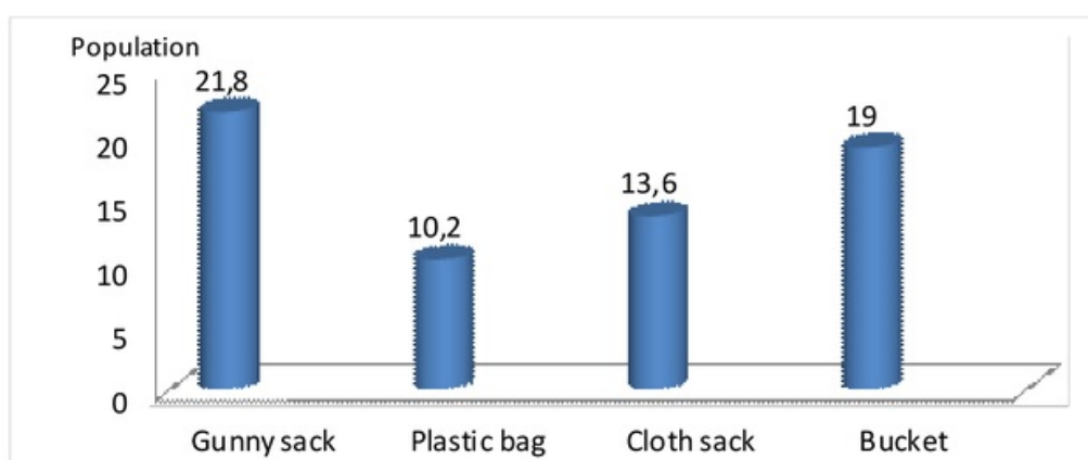
Figure 1 Histogram of Population Density of Sitophilus oryzae on Gunny sack, Plastic Bag, Cloth sacks, and Bucket

The difference of S. oryzae population density on several types of storage containers can be followed in Figure 1.