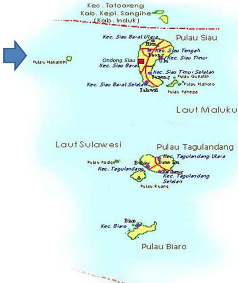
Fig. 1. The Location of Makalehi island that situated in the West of Siau Island

To reach Makalehi island from Manado port takes 3-4 hours by ship to Ulu Siau Port that located in Siau island. Then the trip continue from Siau island to Makalehi by boat takes 1-2 hour to the west of Sulawesi Sea. Makalehi island is one of the remote and small island, that situated on the Sulawesi Sea at latitude 2^{\circ}44'15'' North and longitude 125^{\circ}9'28'' East. Figure 2 shows the Makalehi island and the lake that located in the island.