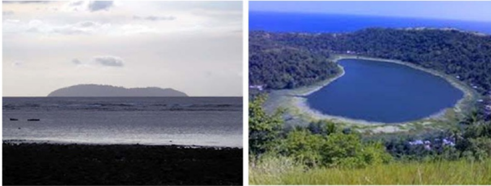
Fig.2 The Makalehi Island and the Lake that Located in the Island

Remote and small islands rely on expensive imports of fossil fuels for electricity generation. In other hand, on small islands have renewable resources which are abundantly available as local energy source. Island communities rely on fossil fuel to supply a large portion of domestic energy needs which are increasing time by time. Consequently, energy supply to such communities is of considerable concern.