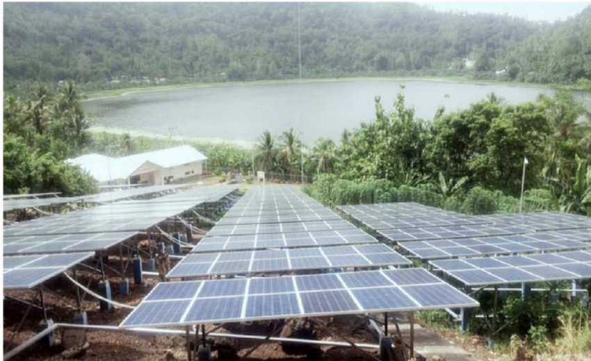
Fig. 3 The Solar Power System Installed in Makalehi island of Indonesia

The existing of centralized solar power system with installed capacity as 260 kWp has shown in Fig. 3