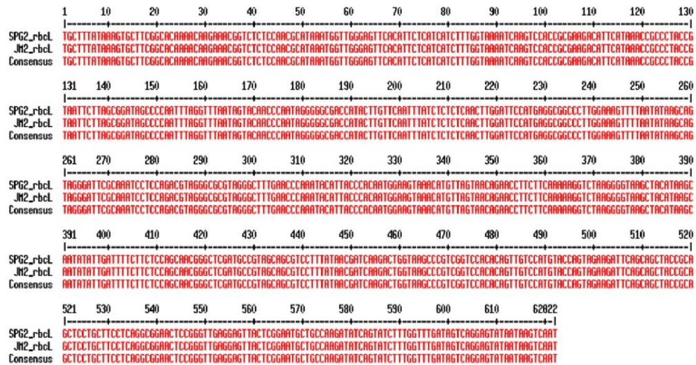
12 Figure 4. Sequence alignment of rbcL gene of Codiaeum variegatum cv. Gold star (SPG2) and royal (JM2) ( http://multalin.toulouse.inra.fr/multalin ).