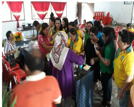
Figure 3. Ice cream production

Kampong chickens are raised using traditional production techniques by almost every village household. They are a side –line activity and are not considered the main source of family earnings. The members of a family generally work in crop cultivation, as labourers, or as traders. Although some families keep more than 1000 birds, they still work in other activities for their main livelihood. In some cases, farmers have integrated their native chicken operations with freshwater fish farming by contracting the cages above fish-pond.