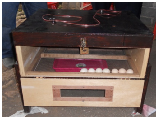
Figure 2. Hatching machine