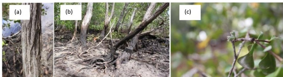
Figure 2. Osbornia octodonta (Myrtaceae): (a) grey, spongy flaking and quite thick bark, (b) exposed root, (c) shoot with fruit.

opposite leaves position. Fruit is a globose. Roots is unspecialised, develop obscure buttresses and spongy bark in large diameter. In Figure 2 several parts of the specimen of O. octodonta collected from Panua Nature Reserved is illustrated.