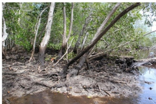
Figure 1. Habitat feature of O. octodonta in Panua Nature Reserve

In general, habitat where this species found seems to be typical. Physically, the habitat is like a pond that is inundated by seawater at spring tide, remaining inundated at low tide, and frequently influence by freshwater. It is predicted that the habitat has a wide range of salinity, and trees of this species can only grow at the more elevated edge side of the pond with a shallow substrate dominated by fine sand sediment. Trees of Ceriops tagal are found to share the same habitat, but they are not in dense population as usual. Figure 1 shows the habitat condition described.