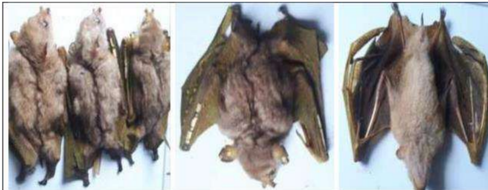
Figure 5. Nyctimene cephalotes

Bodyweight 57.71-58.75 g. Body length 84.44-86.75 mm. Head length 30.22-31.5 mm. Ear length 14.22-14.5 mm. The length of the forearm is 65.55-66.5 mm. Tail length 20.66-21.5. Length of back legs 14.11-14.5 mm. Grayish brown color on body hair. Yellow spots on the ears, wings, and fingers of the wings. Tubular protruding nose. The thin brown line along the back. Short tail (Figure 5).