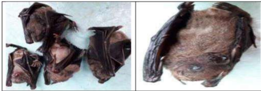
Figure 7. Thoopterus nigrescens

Bodyweight 81.32-93.69 g. Body length 110.03-112.69 mm. Head length from 41.5 to 42.92 mm. Ear length 14.74-15.23 mm. The length of the forearm is 73.21-74.77mm. The length of the rear leg is 16,19-16,31 mm. Gray black body, no tail, short snout (Figure 7).