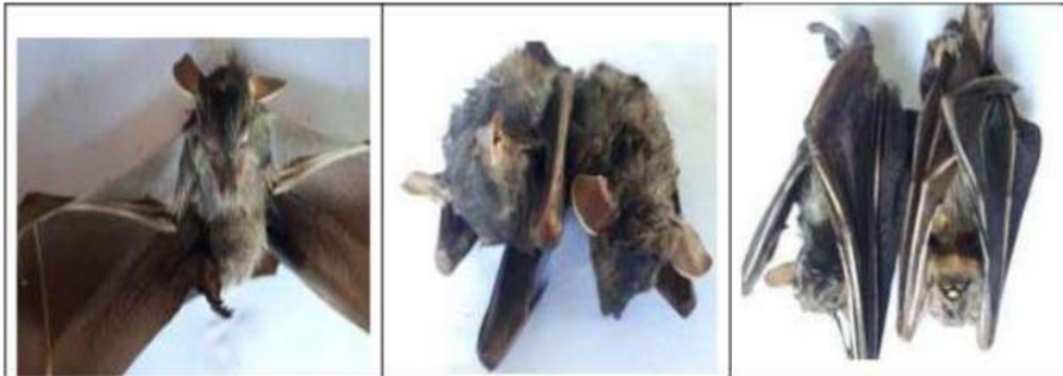
Figure 6. Cynopterus minutus