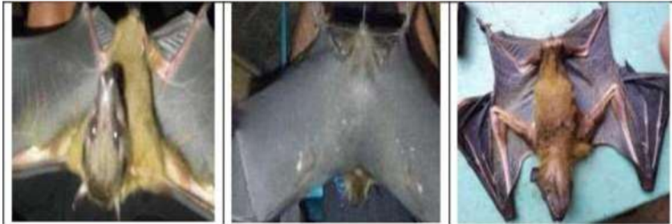
Figure 2. Dobsonia exoleta

33.33 mm. The greenish yellow color on body hair. Black color on the wing skin. Hairless back. (Figure 2). This species has a tail and no claws on the fingers of the two wings.