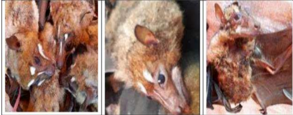
Figure 4. Styloctenium wallacei