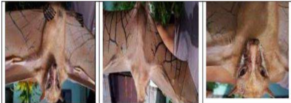
Figure 3. Neopteryx frosti

Bodyweight 230 g. Body length of 175 mm. Head length of 65 mm. Ear length 21 mm. The length of the forearm is 110 mm. The back foot length is 30 mm. Light brown color on the feathers on the body and wings. Shaped mesh on the dark brown stripe-shaped wing. In the head of the lateral frontal side white lines are found from the bottom of both eyes to the mouth (Figure 3). This type is tailed and has no claws on the wings. According to Bergmans and Rozendal (1988) cited by Suyanto (2001), this type weighs 164-190 grams. Head length from 50.7 to 55.8 mm, wing length underwing 104.9-110.6 mm.