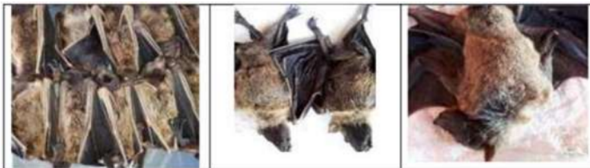
Figure 1. Acerodon celebensis

Bodyweight 290.21-312.47 g. Body length 180.14-187 mm. Head length 66.59-76.24 mm. Ear length is 30.18-30.29 mm. The length of the forearm is 122.86-123.81 mm. The length of the rear leg is 37.95 mm. The golden yellow color on the feathers of all parts of the body and wing fingers. Brown color on the snout, wings, and toes. (Figure 1). This species has no tail.