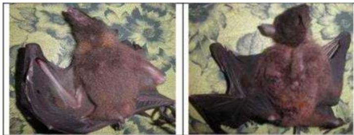
Figure 8. Rousettus amplexicaudatus

Bodyweight ranges from 72.75 to 75.63 g. Body length 109.25-114.69 mm. Head length of 45.59-47.63 mm. Ear length of 15.86-16.16 mm. The length of the forearm is 71.66-72.75 mm. Tail length 18.94 mm. The length of the rear leg is 17.66-18.38 mm. The body is grayish brown, the snout is long, has a blackish-brown tail, wings (Figure 8).