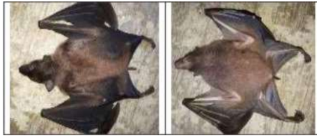
Figure 9. Rousettus sp.

Bodyweight ranges from 150-216.66 g. Body length 95-165 m. Head length of 39-53.3 mm. Ear length is 25.3-26 mm. The length of the forearm is 85-96.66 mm. Head length of 22-29.66 mm. According to body weight and morphometric size, this bat is not Rousettus amplexicaudatus . However, some other physical features are similar to Rousettus amplexicaudatus (Figure 9).