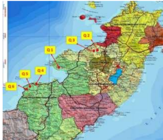
Figure 9 – Map of boulder quarry distribution (suppliers)

All of these owners/entrepreneurs have experience in supplying boulder stones, both in work in the South Minahasa Regency and in North Sulawesi (manado).