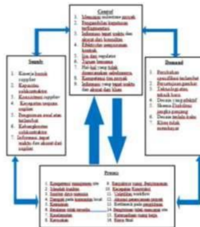
Figure 1. Supply chain uncertainty cycle

Supply chain risk is the possibility of unexpected events or probabilities, whether large or small, that adversely affects the supply chain resulting in disruption or failure at strategic, tactical and operational levels (Ho et al., 2015). Major risks are risks that are very unfavorable and rarely occur but have a negative impact on work, consisting of natural risks (eg extreme weather, earthquakes), and human-caused risks (terrorism, war and political instability). Minor risk is the risk that comes from activities within the company or relationships with partners in the company along the supply chain, which consists of infrastructure risk, supply risk, demand risk and manufacturing risk. Infrastructure risk consists of information technology, financial systems and transportation. Sources of supply chain risk can occur throughout the supply chain, but the sources can be classified into four groups, namely the Supply side, Supervision, Implementation process, and Demand (Mason-Jones & Towill, 2000). The problem of construction project delays is caused by supply chain uncertainty. Based on this model, (Gosling, et al., 2012) then defines supply chain risk that forms a cycle of uncertainty (uncertainty circle) as shown in Figure 1.