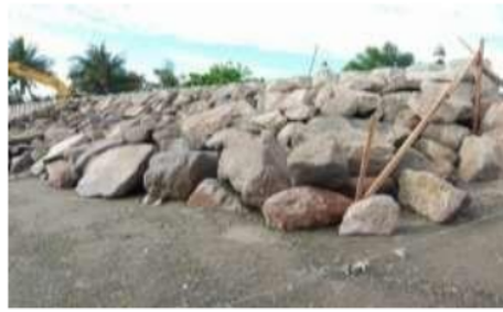
Figure 2. Boulder stone at the research site