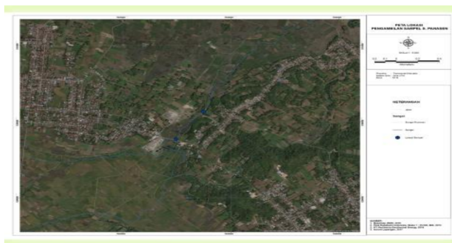
Figure 1. Water Sampling Location

The main equipment used in this study is a water sampling tool: water sampler, ice box, GPS, pH meter, thermometer, and spectrophotometer: Equipment used for water quality parameter concentration analysis (PP No. 82/2001). The research materials were Tondano watershed Map, aquades, tissue, labels to mark the sample, camera and writing instruments.