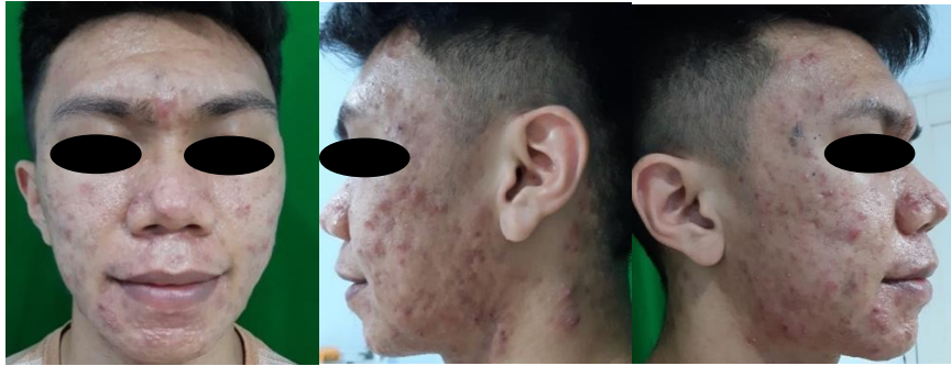
Patient A. After 4 weeks of treatment (Total number of lesions \pm 40 )