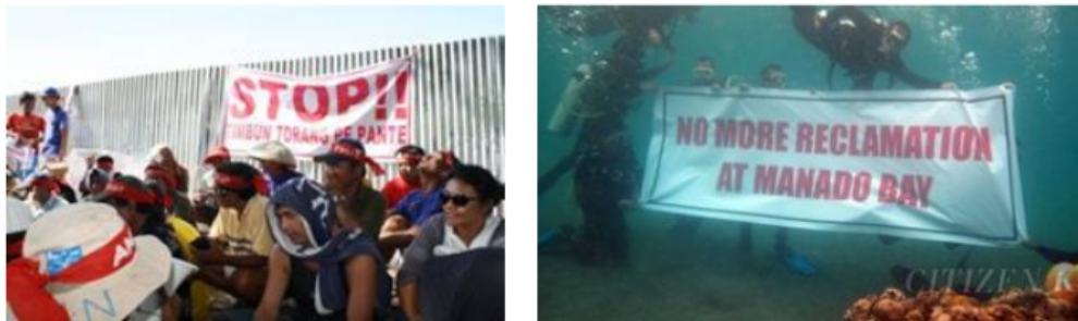
Figure 6. Action contra reclamation

Since the 1990s, Coastal Reclamation blocked as a megaproject long Manado coastline. New land by the sea is being created to host business affairs, such as the new shopping palaces, hotels, banks, seaside restaurants, and modern entertainment services. The area of new land outstretches 1.6 km long and spread over 200 m away from the mainland. Since the constructions, there has been sporadic resistance from traditional fisherfolk. The hottest dispute arose in 2009. Fisher protests in different parts of the bay. They began to run avocation to different stakeholders, create a network of communication and started to show direct solidarity each time a group of fisherfolk was faced with conflict. The open confrontation followed by developers' wave of repression did not make the fishers back off, on the contrary, they gain the moment successfully interrupted reclamation work.