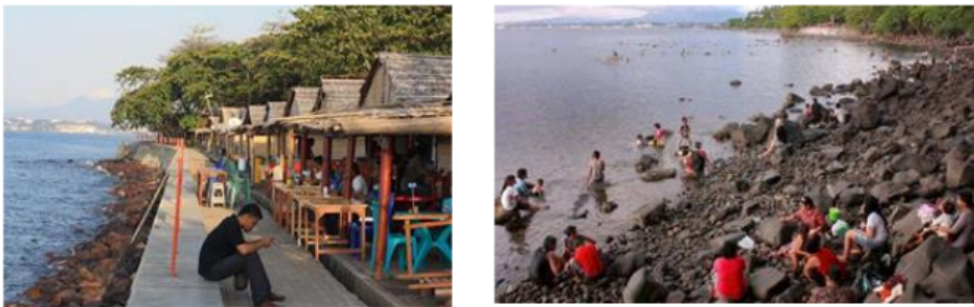
Figure 5. Residents place for a picnic and spent leisure times with traditional culinary.

The growth of tourism activity and scuba diving sport since the past two decades, marine tourism is concentrated around Bunaken Island and became one of the world's dive tourism icon. The number of tourists increased, resort and diving operators thrived, especially in the conservation area. More than fifty percent of diving operators, resorts, hotels were owned by foreigners and preferred Bunaken as their home base. The exploitation of natural resources on the spot directly was vulnerable. Reducing this pressure on Natural Park, some dive operators aggressively seeking new potential spots with a good selling point. Exploration along the gulf coast, they found the number of interesting spots that hold potential as a mini marine park near Malalayang and Kalasey (6-8 new spots found).