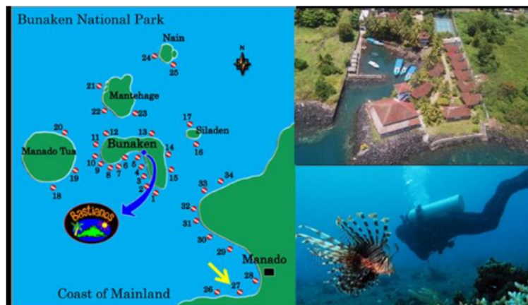
Figure 4. Dive spots, diving operators and resorts around Manado

There are two interesting dive spots as parts of 87 destination spots of North Sulawesi available for the dive sports lovers. The underwater surface contains rich biodiversity of marine life combined with some exotic creatures of the deep sea. Some of the diving operators reside in this area such as Murex, Larascasse, Petra dive sports, Mapia house reef, bobocha, city extra, complete with their supporting facilities like a resort, dive equipment's and their outfits.