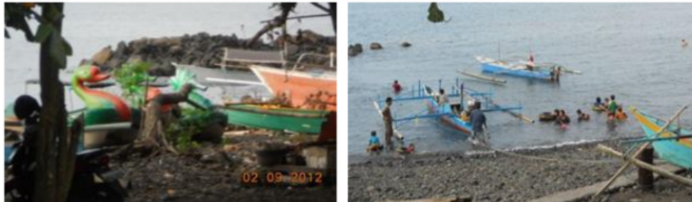
Figure 3. Fisher boats moored at the recreation area

The growth of marine tourism activities is considerable development along much of the world's coastline, increasing rapidly to the construction for tourism and recreation purposes and ultimately had marginalized the former occupants.