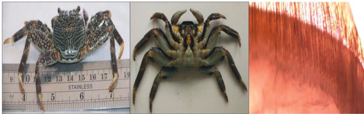
Fig. 1. Male Stone Crab or Grapsus albolineatus (Latreille in Milbert, 1812) Obtained from the Coastline of Tanawangko Village, Minahasa Regency, North Sulawesi when at the D Molting Stage

The distribution of pigment types in each organ of G. albolineatus crabs (Latreille in Milbert, 1812) presented in the table above shows that the first fraction produced yellow color identified as a \beta -carotene pigment, contained in the gonad, hemocyanin, and hepatopancreas organs. The second fraction appeared to be orange-colored identified as echinenone pigments, contained in the hepatopancreas, epidermal layer, and carapace organs. Meanwhile, in the third fraction,