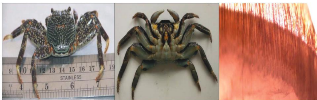
Fig. 1. Male Stone Crab or Grapsus albolineatus (Latreille in Milbert, 1812) Obtained from the Coastline of Tanawangko Village, Minahasa Regency, North Sulawesi when at the D Moulting Stage

The distribution of pigment types in each organ of G. albolineatus crabs (Latreille in Milbert, 1812) presented in the table above shows that the first fraction produced yellow color identified as a \beta -carotene pigment, contained in the gonad, hemocyanin, and hepatopancreas organs. The second fraction appeared to be orange-colored identified as echinenone pigments, contained in the hepatopancreas, epidermal layer, and carapace organs. Meanwhile, in the third fraction,