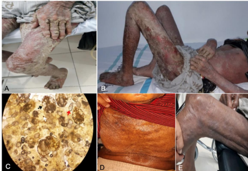
Figure 2. Patient of Case 1 showing diffuse erythematous maculopapular, generalized gray-yellow crusts (A,B); mineral oil scraping showing Sarcoptes scabiei mite (black arrow), eggs (red arrow), and feces (white arrow) (C); and clinical recovery after four weeks of therapy (D,E).

contagious family members were also treated with permethrin once a week and continued until contact with infected patients was terminated, or patients recovered fully.