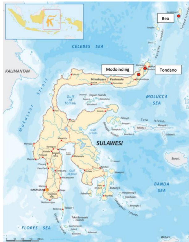
Figure 1. Map of Sulawesi indicating the source of cases in North Sulawesi.

Three cases of crusted scabies in this study occurred in the span of six months within the same year in three different places in North Sulawesi Province. The patients were from Beo, Modinding, and Tondano (Figure 1).