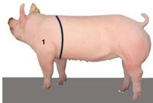
(Figure 1. Measuring Pig Chest Circumference)