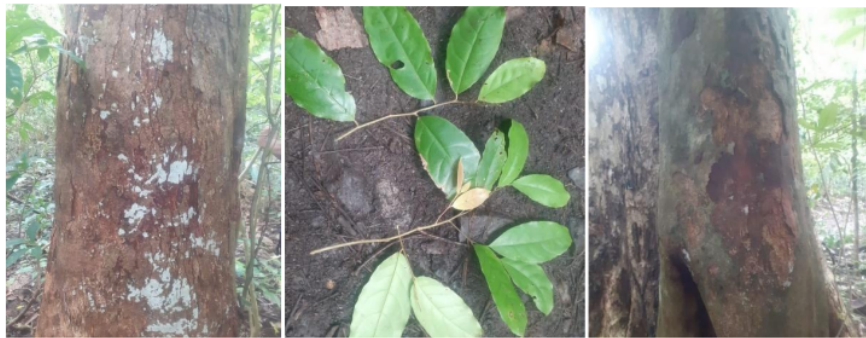
Fig. 4. Homalium celebicum Koord. (Endemic flora in BNTP area, North Sulawesi)

The value of plant species diversity at each tree level is greater than 3. The level of the sapling with a diversity index of 3.6, the level of the pole with a value of 3.15, and at the tree level with a value of 3.11. On 47 plots or plots of observations obtained relatively equal diversity index values. This shows that at the habitat conditions in all observation plots are relatively homogeneous, when viewed from the aspect of disturbance to the ecosystem, because in all plots in BNTP there is no periodic destruction. This is understandable because the area is a nature conservation area. The results of the calculation of the species evenness index showed that the values were relatively homogeneous, ranging from 3.11- 3.75. The diversity of flora species at the level of trees, poles and sapling in the BNTP area is included in the category of high abundance. This means that the diversity of flora species in the community is increasingly stable in the BNTP area.