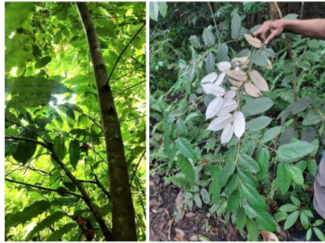
Fig. 3. Pterospermum celebicum Miq. (Endemic flora in BNTP area, North Sulawesi)