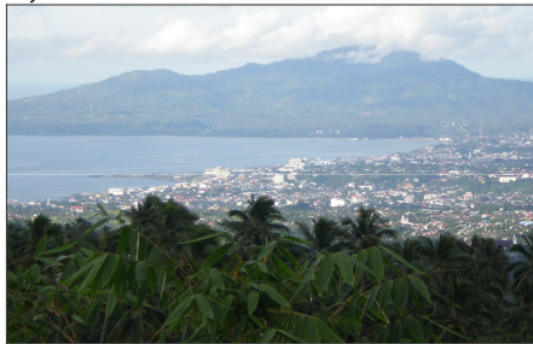
Figure 1. Manado City

Entering globalization era, Indonesian economic developing need to be advanced, because it can invited new investor and hoped its will develops the advantage area. One of this is waterfront area including coast, river and lakes. Developing of waterfront area was being the new tendency of city facilities development, especially in big city that has obstacle in land and has a big potency on water. Manado City is a city that place in Manado bay (Figure 1), and by geographic city distribution equal with water and Manado bay. One of this distribution project shore reclamation that hopes to be a new business area that could to rise up Manado city's economic, except to empower Manado as waterfront city.