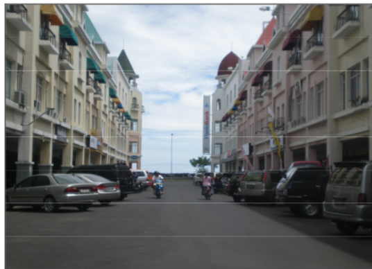
Figure 4. Stores and home office on the reclamation Area