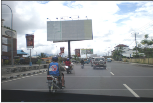
Figure 2. Boulevard Street