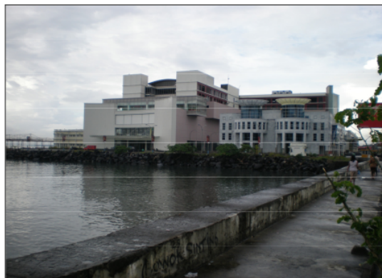
Figure 5. Mall On the Reclamation Area