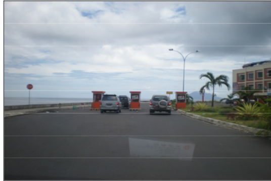
Figure 3. Manado Reclamation Area